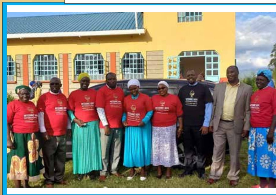
Nairobi Delegate representing Messianic Hope International at Kabati after distributing food and encouraged brethren.