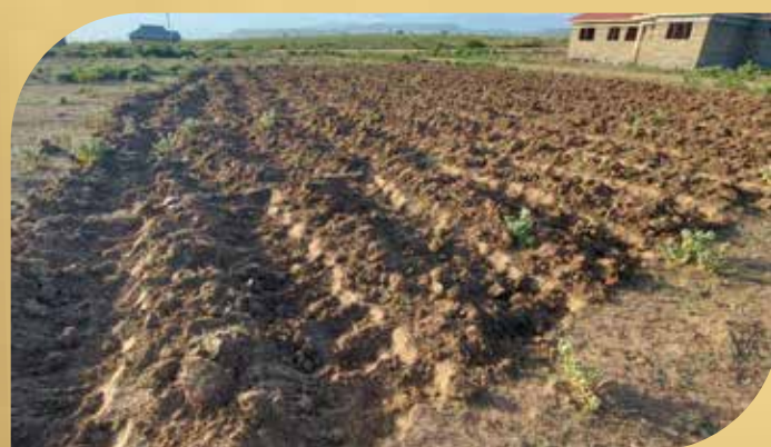
Children's home garden project aimed at feeding the orphans