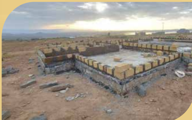
Construction taking shape