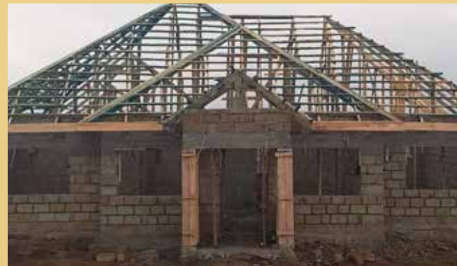
Trusses woodwork complete