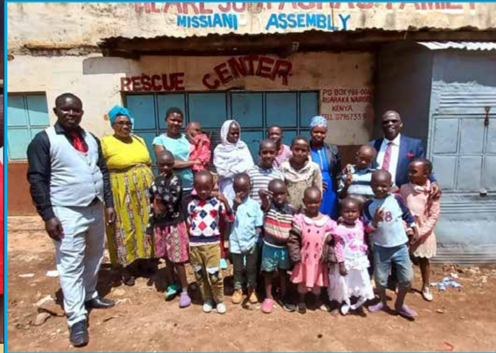
Renovated Shalom Rescue Center