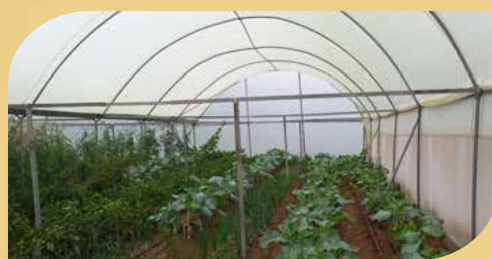
Proposed Greenhouse farming to feed the orphans