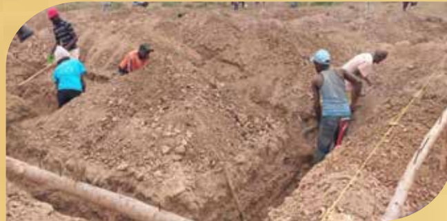
Digging the Foundation