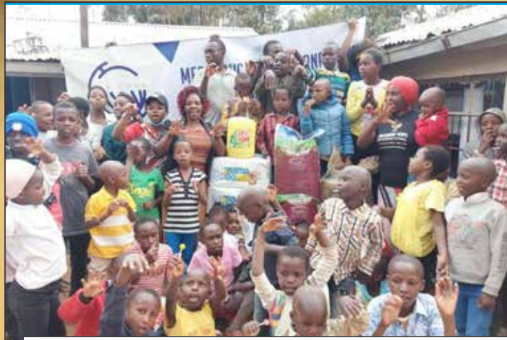
Messianic Hope International distributing food and necessities to Bridge of Hope Children's Home