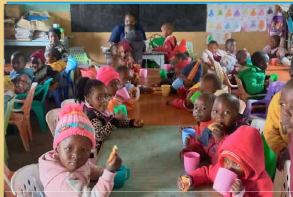
Supporting Feeding programme in Mercy Early Childhood Development schools