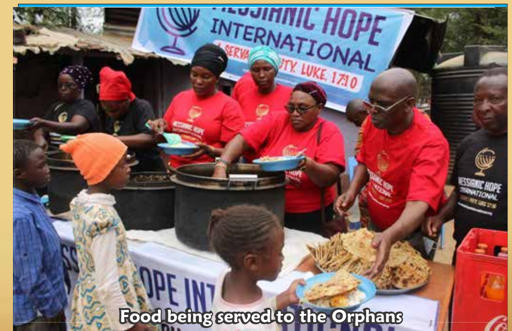
Food being served to the Orphans