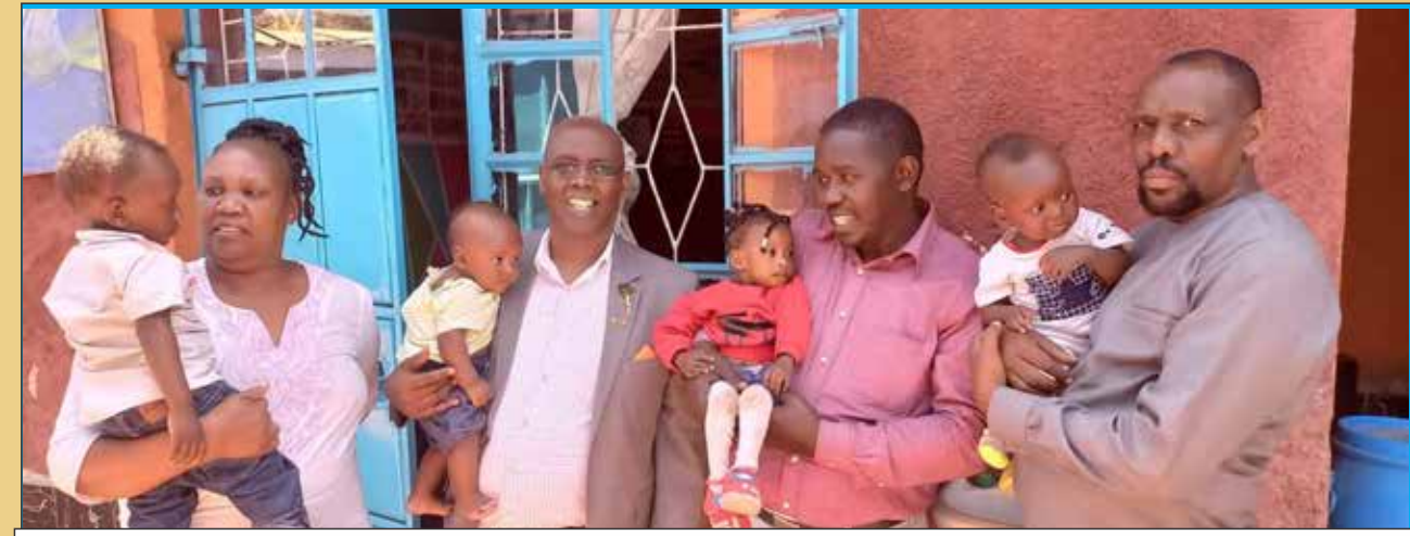
Rescuing, giving hope and a future to abandoned children at Salem Rescue Centre